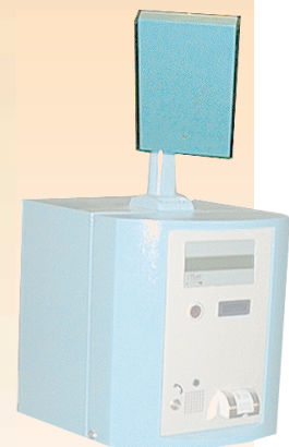
Installation on a parking terminal.